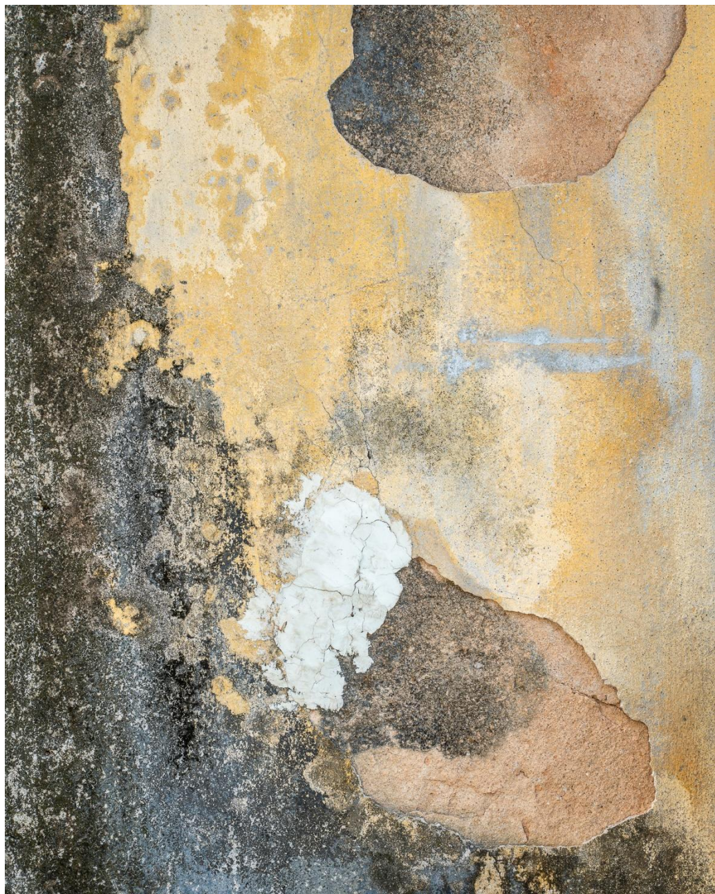
Hong Kong 32 Archival print on paper Signed and numbered in pencil Limited edition of 30