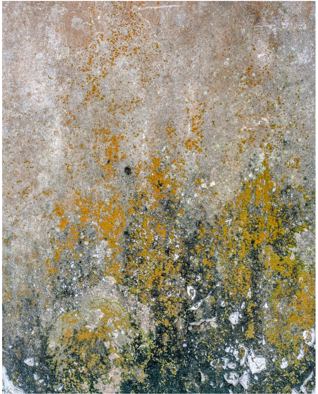
Hong Kong 30 Archival print on paper Signed and numbered in pencil Limited edition of 30