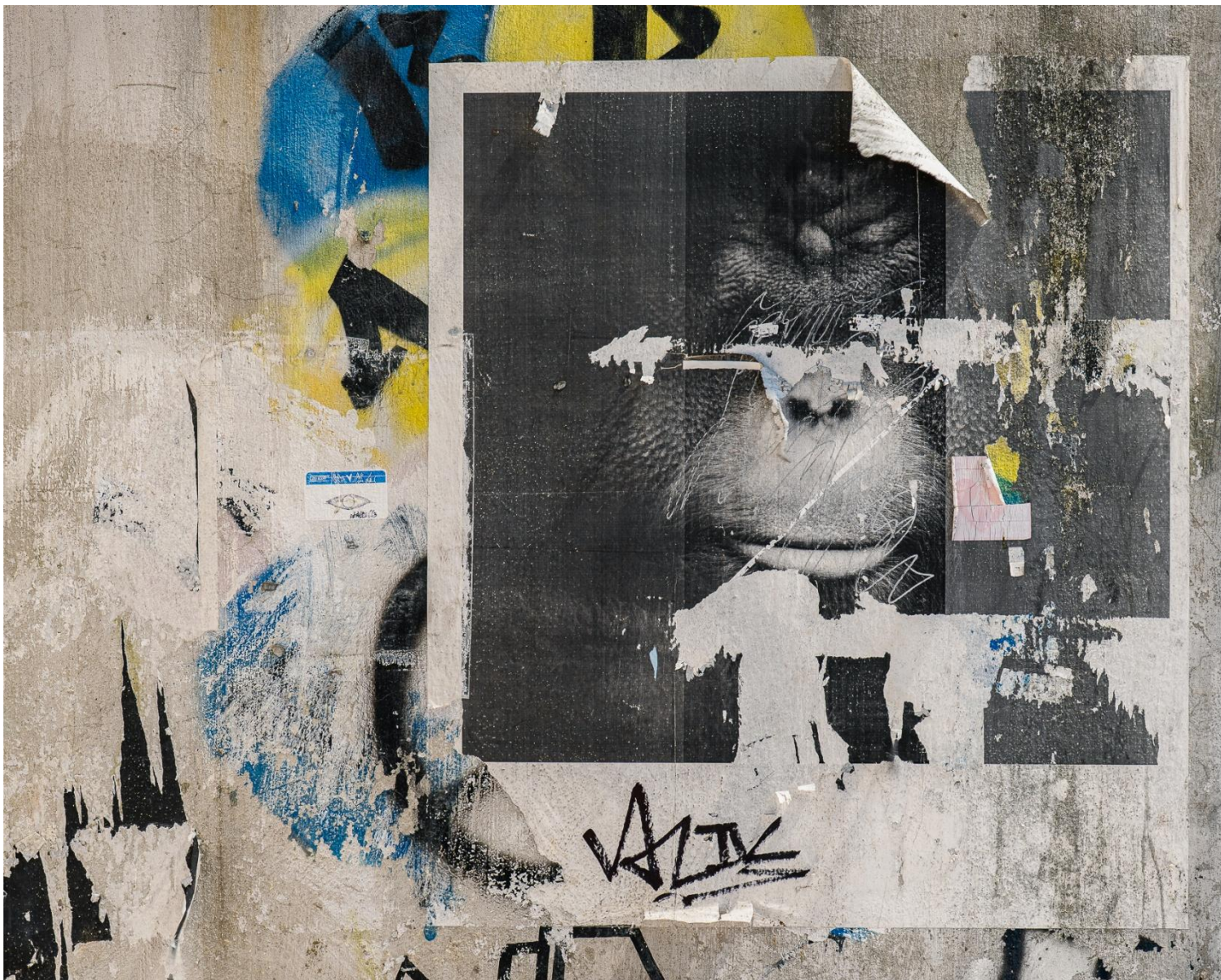
Hong Kong 25 Archival print on paper Signed and numbered in pencil Limited edition of 30