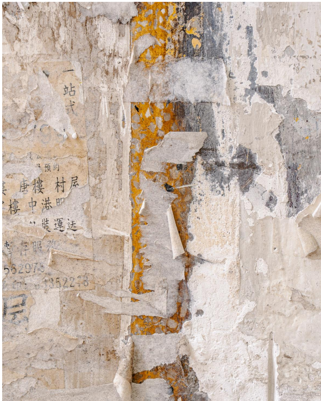
Hong Kong 22 Archival print on paper Signed and numbered in pencil Limited edition of 30