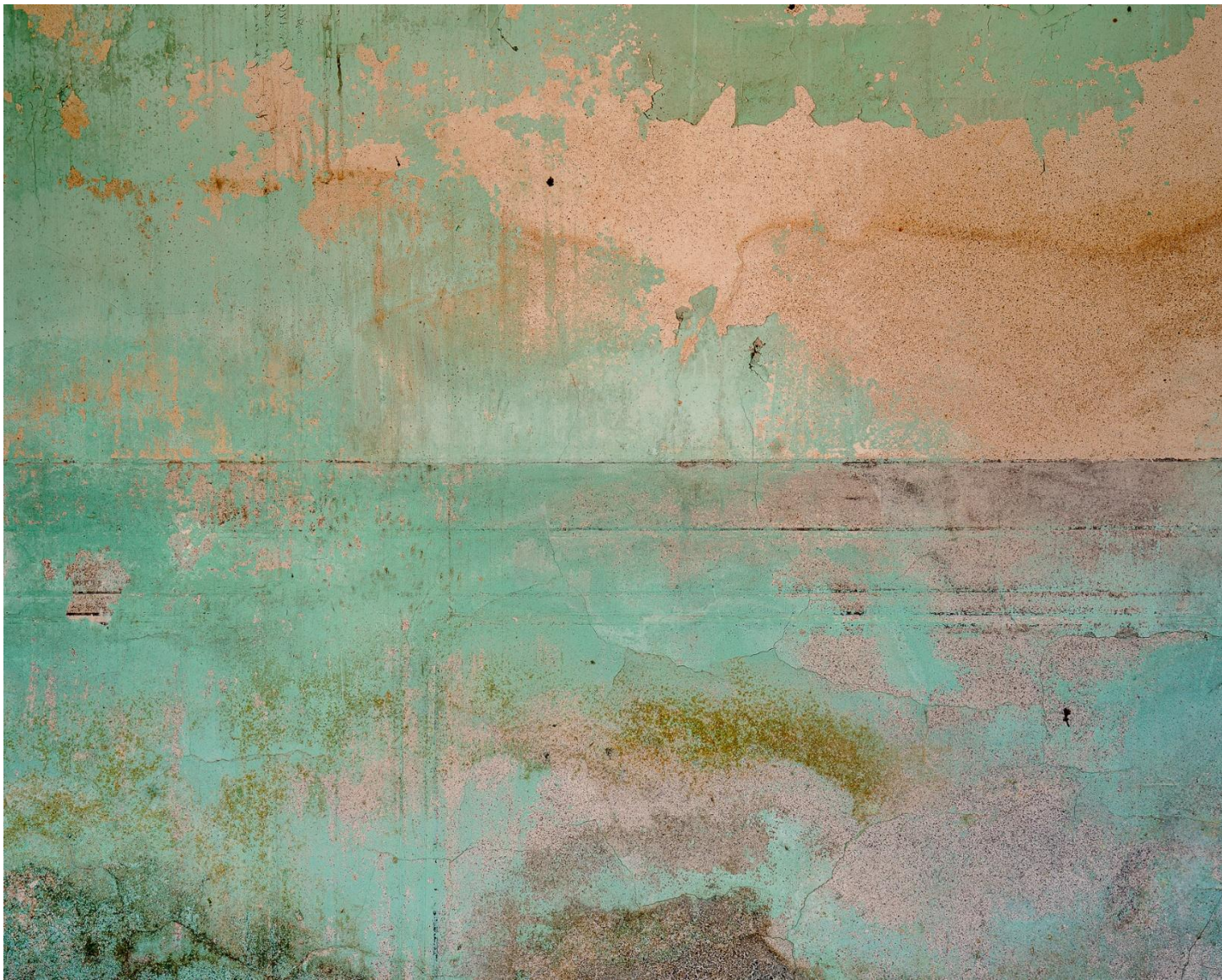
Hong Kong 19 Archival print on paper Signed and numbered in pencil Limited edition of 30