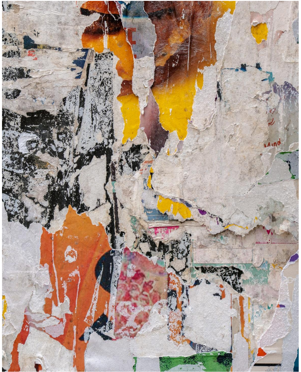
Hong Kong 28 Archival print on paper Signed and numbered in pencil Limited edition of 30