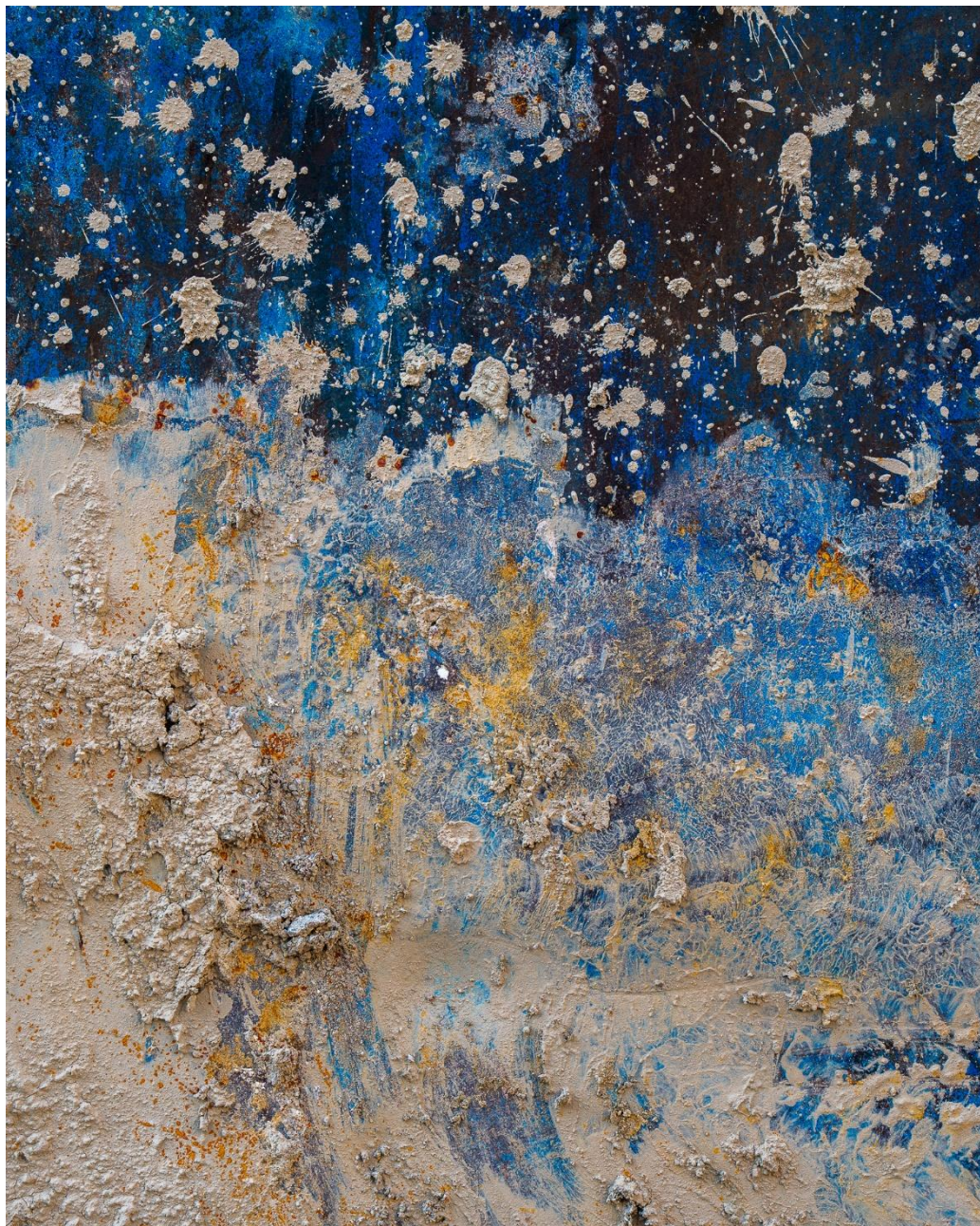
Hong Kong 23 Archival print on paper Signed and numbered in pencil Limited edition of 30