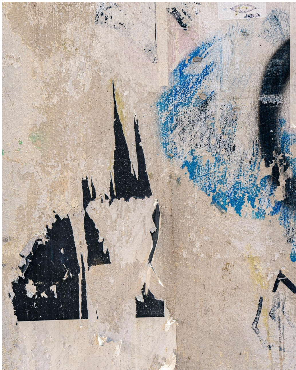
Hong Kong 24 Archival print on paper Signed and numbered in pencil Limited edition of 30