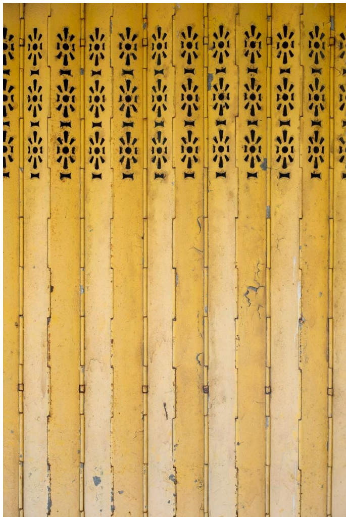
Hong Kong 33 Archival print on paper Signed and numbered in pencil Limited edition of 30