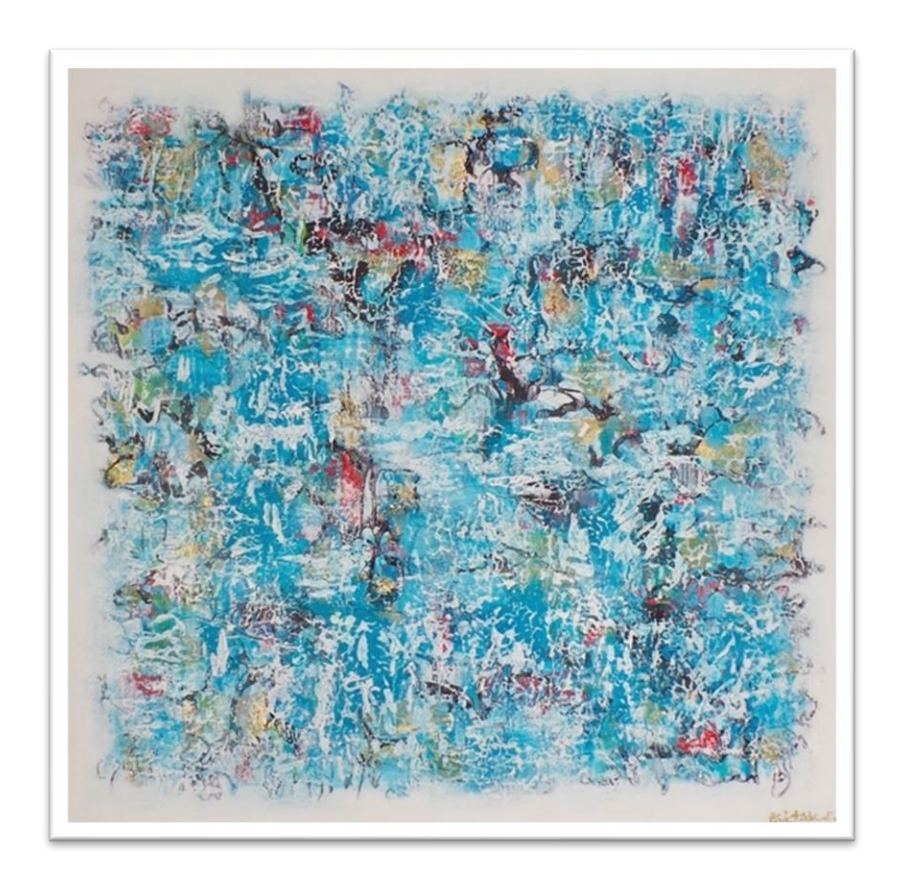
Rhythm & Blues. Oil on canvas. 104 x 104 cm. £3,850 inclusive of frame