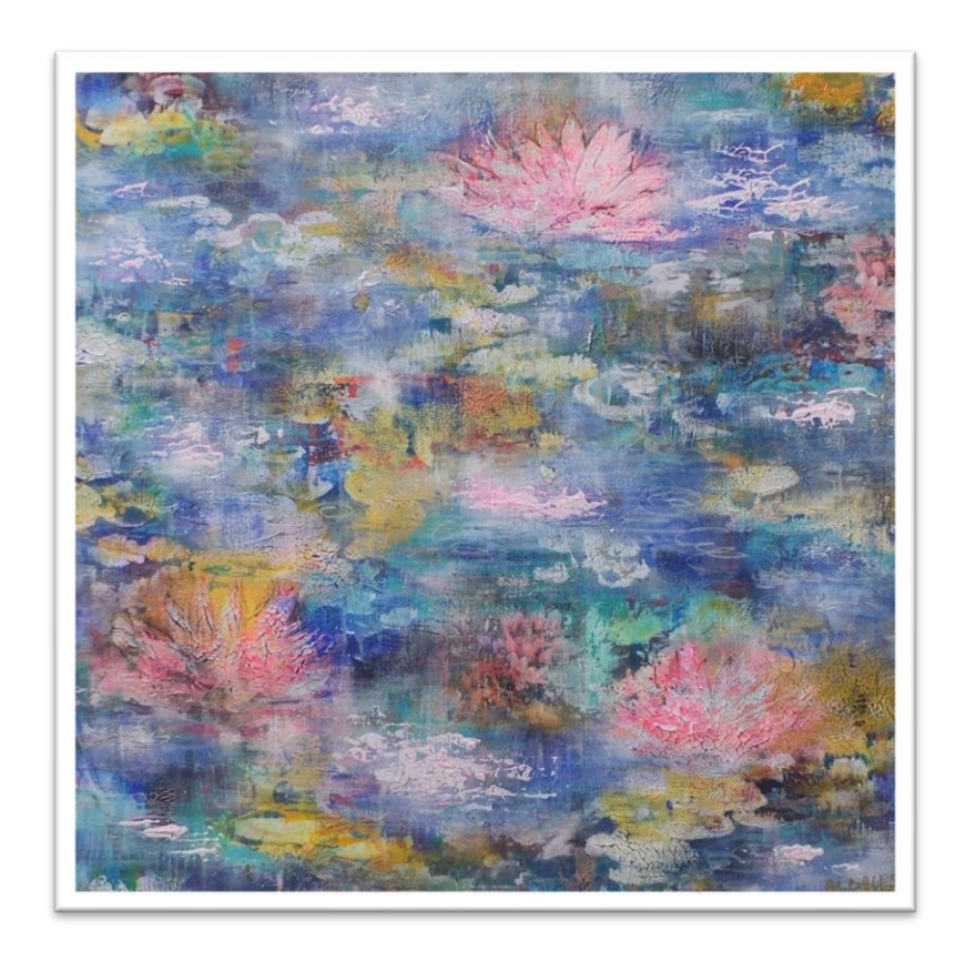
Waterlily Life. Oil on canvas. 84 x 84 cm. £2,850 inclusive of frame