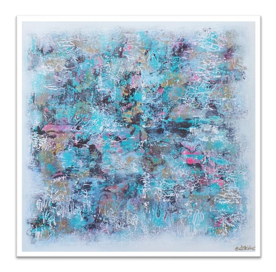
Chasing the Light. Oil on canvas. 84 x 84 cm. £2,850 inclusive of frame