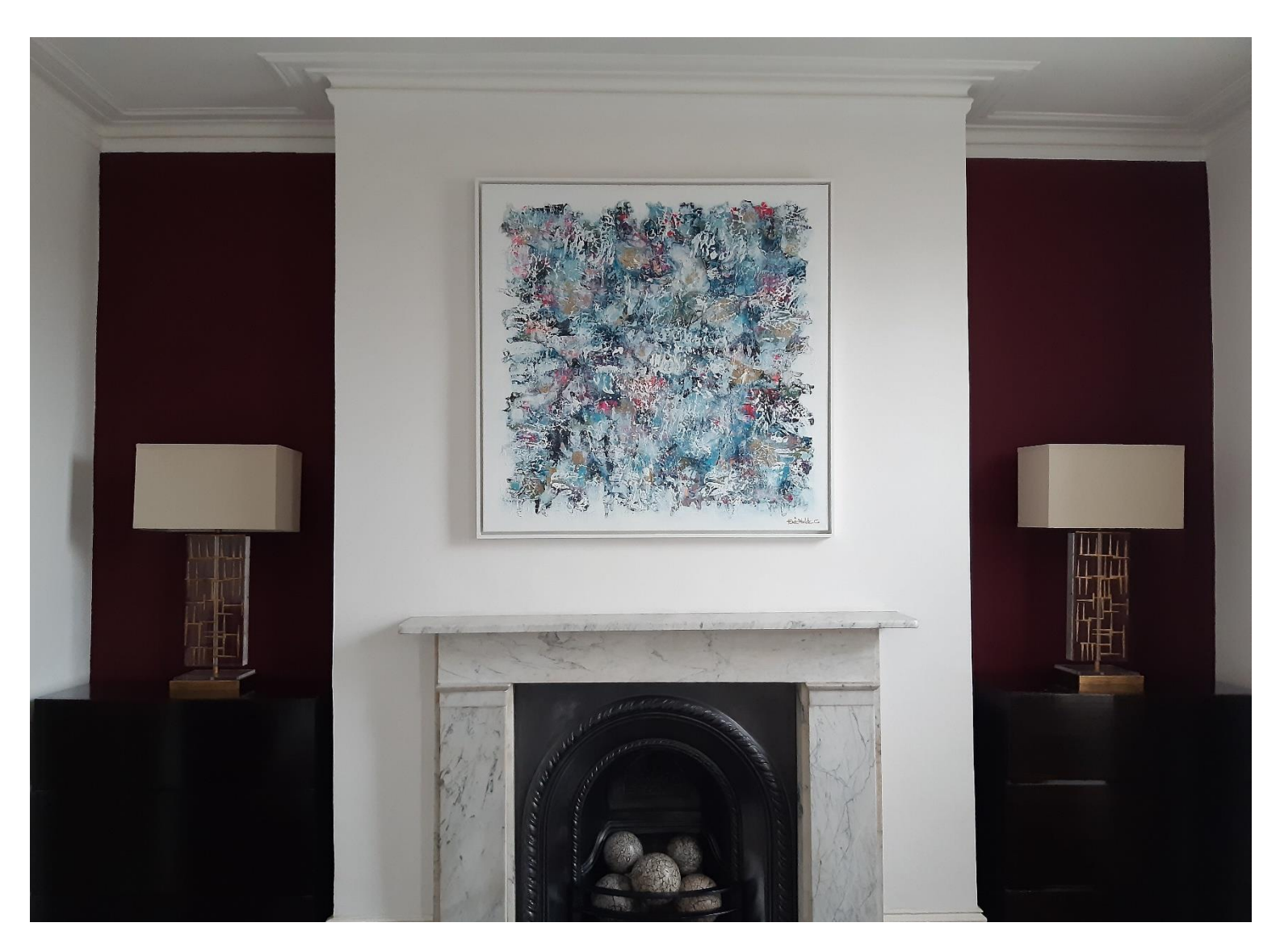
Dreamcatcher. Oil on canvas. 104 x 104 cm. £3,850 inclusive of frame