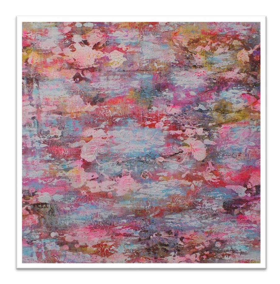
Pretty in Pink. Oil on canvas. 104 x 104 cm. £3,850 inclusive of frame