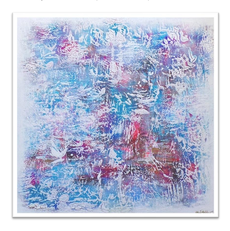
Dancing with Colour. Oil on canvas. 104 x 104 cm. £3,850 inclusive of frame