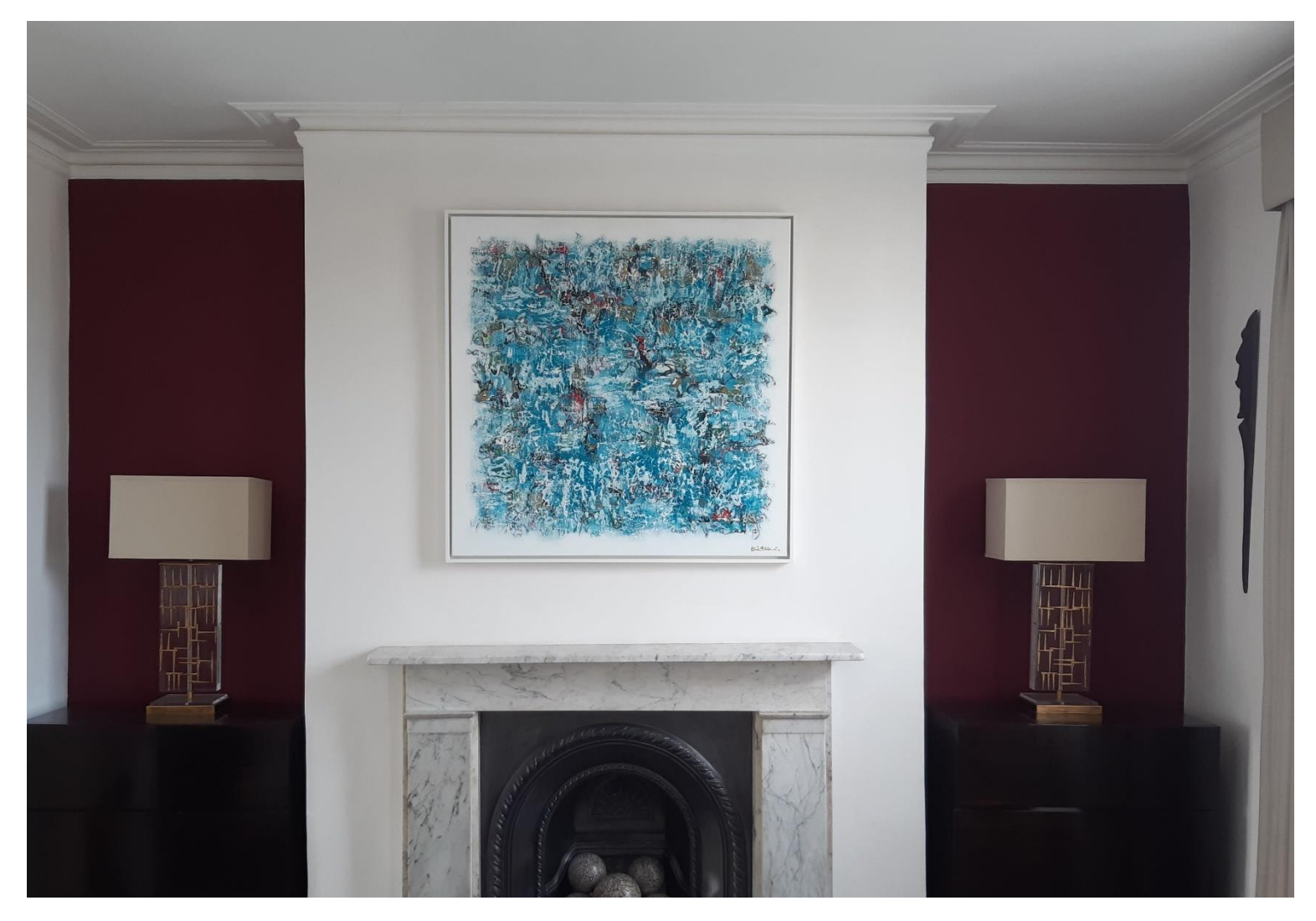
Rhythm & Blues. Oil on canvas. 104 x 104 cm £3,850 inclusive of frame