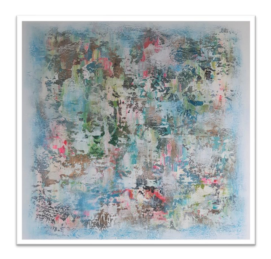
Colour My Life. Oil on canvas, 104 \times 104 \text{ cm} . £3,850 inclusive of frame